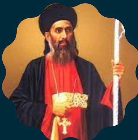
Parumala Thirumeni Our Patron Saint